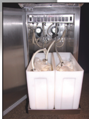
Refrigerated storage cabinet showing slide-out tray and bag connection system.